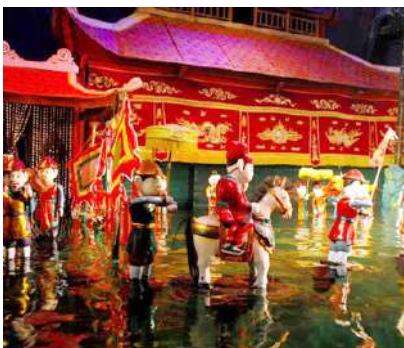
Water Puppet Performance

Note: Cruise itinerary may be changed without prior notice