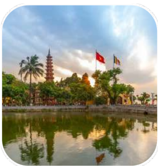
Tran Quoc Pagoda

Distance Noi Bai Airport – Hanoi Central: 30 km => 50 minute transfer